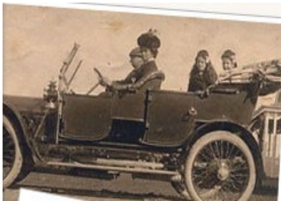
Figure 2 A piece of the distinctive features of Mahoe is just visible at the right of this photo – namely a set of the house’s double verandah posts.