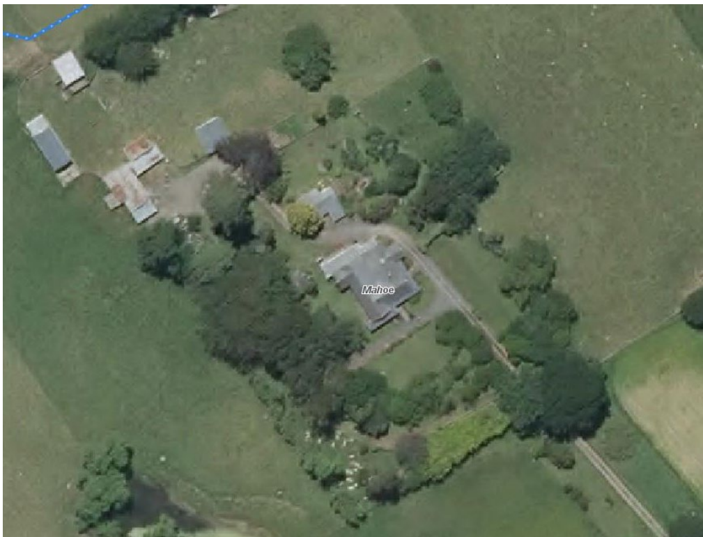
Figure 5 A closer view of the layout of the Mahoe property