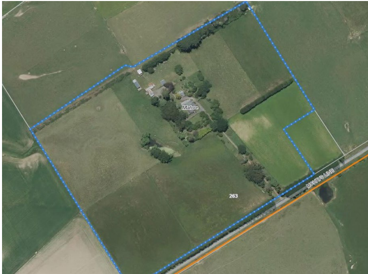
Figure 4 The Mahoe property in relation to McKays Line